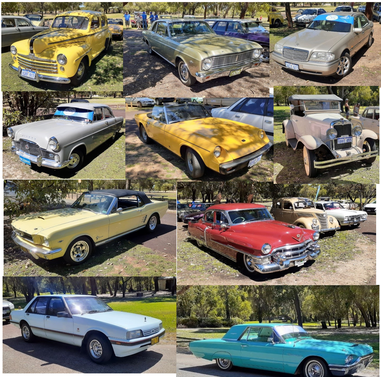
More Photos of the VAA Breakfast