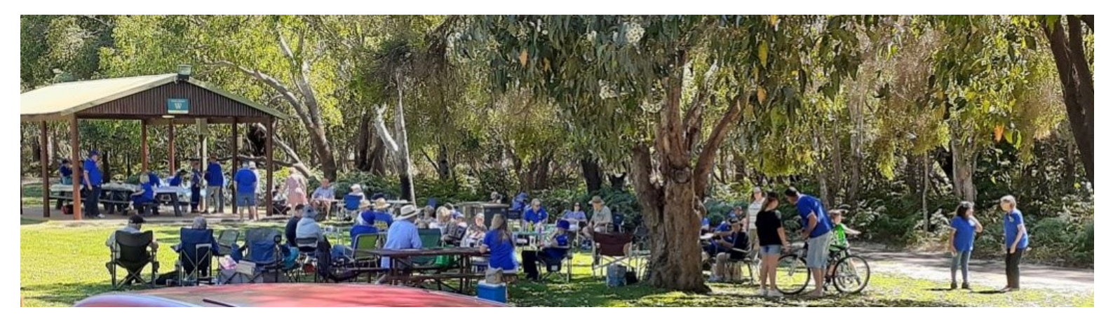
VAA Breakfast We had a very pleasant breakfast at Whiteman Park and a great turnout of classic cars.